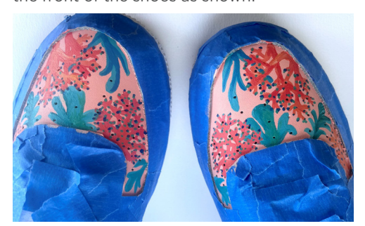
Step 15 - Colours: Ocean Blue, Intense Red, Pure White.

Mix blue, yellow and white together to create a light turquoise and add more dots to the orange/coral complex shaped coral on the front of the shoes as shown.