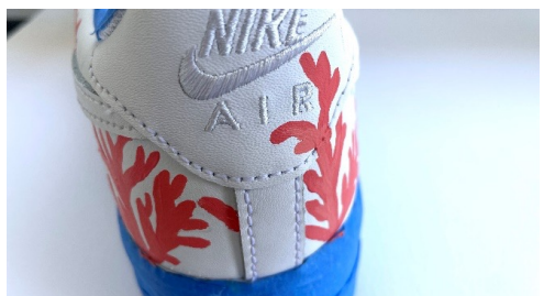
Step 4 - Colours: Intense Red, Vivid Yellow, Pure White.

Lighten a coral colour as used in Step 3, adding more white to it to create a light peach/coral colour for the background. Use this mix to paint in the area at the front of the shoes as shown. Once dry, you may like to apply a second coat for even coverage.