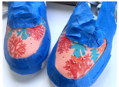
Step 12 - Colours: Ocean Blue, Vivid Yellow, Pure White.

Create coral and orange colour mixes similar to those used for the more complex coral shapes in step 3. Use these to paint the more complex coral shapes on the front of the shoes as shown. As they dry different mixes can be applied in places as desired on top of the base colour to create some darker/lighter areas.