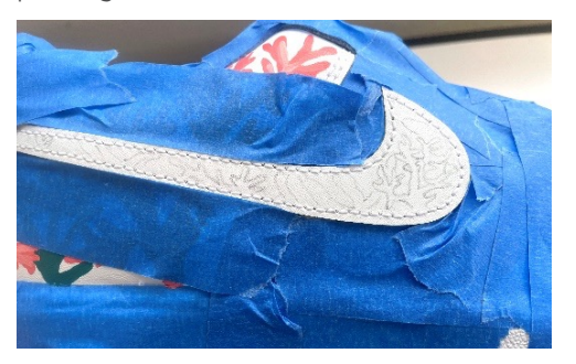
Step 7 - Colours: Ocean Blue, Intense Red, Pure White.

Once the previously painted areas are completely dry, place masking tape around the tick icon on the outer facing side of each shoe, so that surrounding areas are protected from paint getting on them while painting that area.