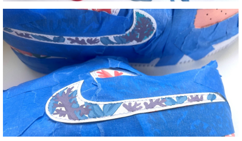
Step 9 - Colours: Ocean Blue, Vivid Yellow, Pure White.

Create a light aquamarine colour by mixing blue, yellow and white. Use this mix to fill in around the coral and seaweed in the background area of the tick but keeping within the stitching as shown.