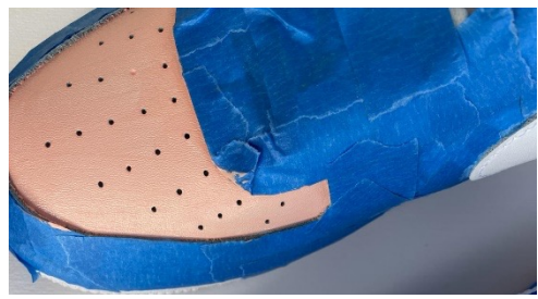
Step 5 - Colours: Ocean Blue, Vivid Yellow, Pure White.

Lighten a coral colour as used in Step 3, adding more white to it to create a light peach/coral colour for the background. Use this mix to paint in the area at the front of the shoes as shown. Once dry, you may like to apply a second coat for even coverage.