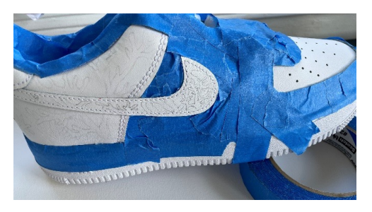
Step 3 - Pebeo Setacolour Leather Colours: Intense Red. Vivid Yellow. Pure White.

On a palette, mix together yellow, red and white to create different tints of coral, orange, peach and peachy-pink. Apply paint to the coral shape drawn on the back of the shoes. Allow paint to dry before adding darker or lighter tints over any base colour put down.