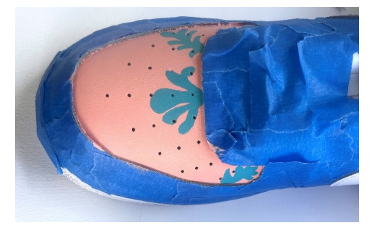
Step 11 - Colours: Intense Red, Vivid Yellow, Pure White.

Ensure the front section of the shoes are dry and then use the same mix from step 9 to paint a base colour within the seaweed shapes on the front section of the shoes as shown.